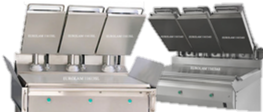
Clam Shell (EUROLAM™ is 2X More Durable)