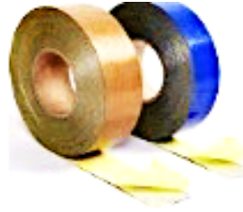
PTFE Coated Metal Detectable Tape