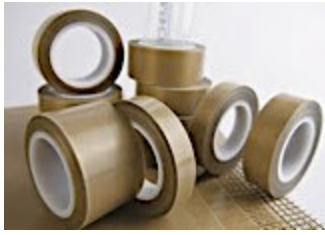
PTFE Coated Glass Tape