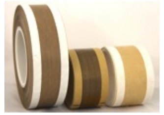
PTFE Coated Zone Tape